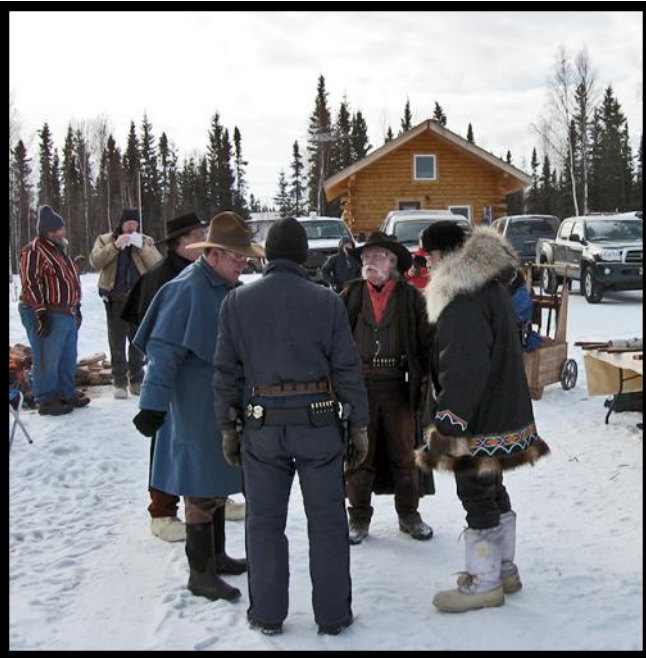
The cold prompted a variety of attire at the recent FYB shoot. Pictured from the left are Alaska Renegade, Wrangell Mountain Red and Nicked M. Good in the background. In the foreground are Lead Monger, Kootenai Brown, Smithy Jim, Judge Yukon Hatch and Poco Loco Louie.