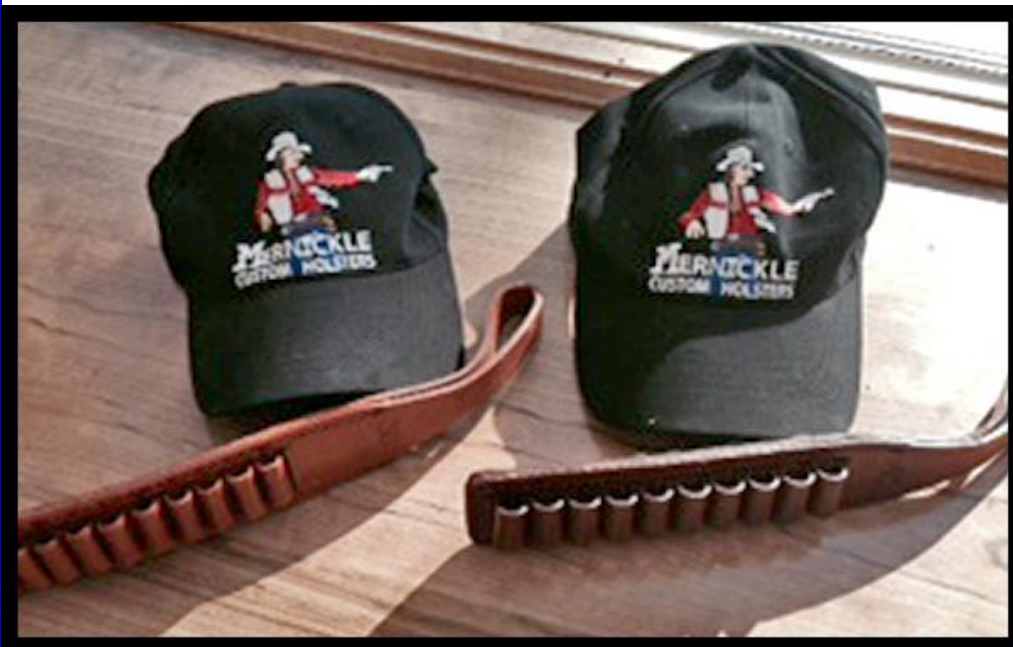
Mernickle Custom Holsters is the first national level vendor to respond to a letter of request from GHSS asking for prize donations for the state championship shoot. As seen here in this photo forwarded by Pokin' A Long, their donation was comprised of two caps and two loading strips.